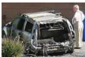
The car destroyed by one of the firebombs in a researcher's driveway.

Animal rights activists are believed to be responsible for the attacks.